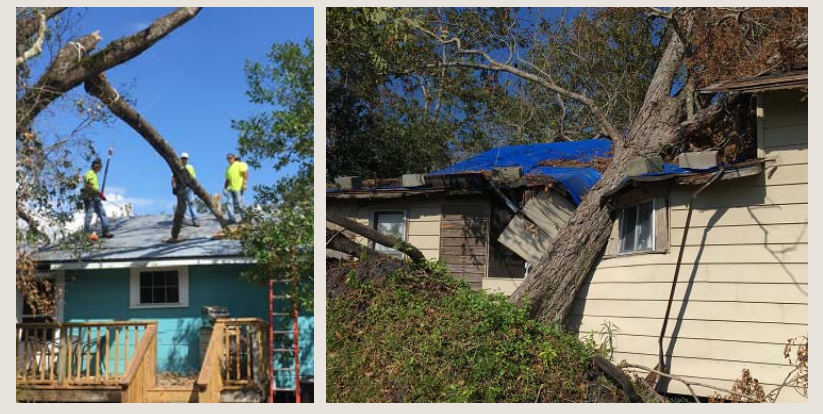
Members from the Cookeville Disaster Relief Team deployed to Florida last week to help clear some of the debris from Hurricane Michael.