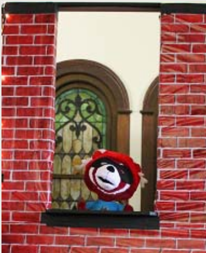
Vacation Bible School had a puppet show!